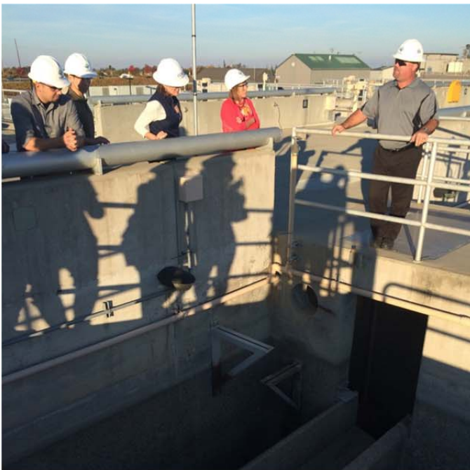
Photos from the November 2015 tour of the Contra Costa Water District's Randall-Bold Water Treatment Plant